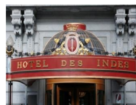
Hotel des Indes

Venue of the P.R.I.M.E. Finance Annual Conference 22 - 23 January 2018